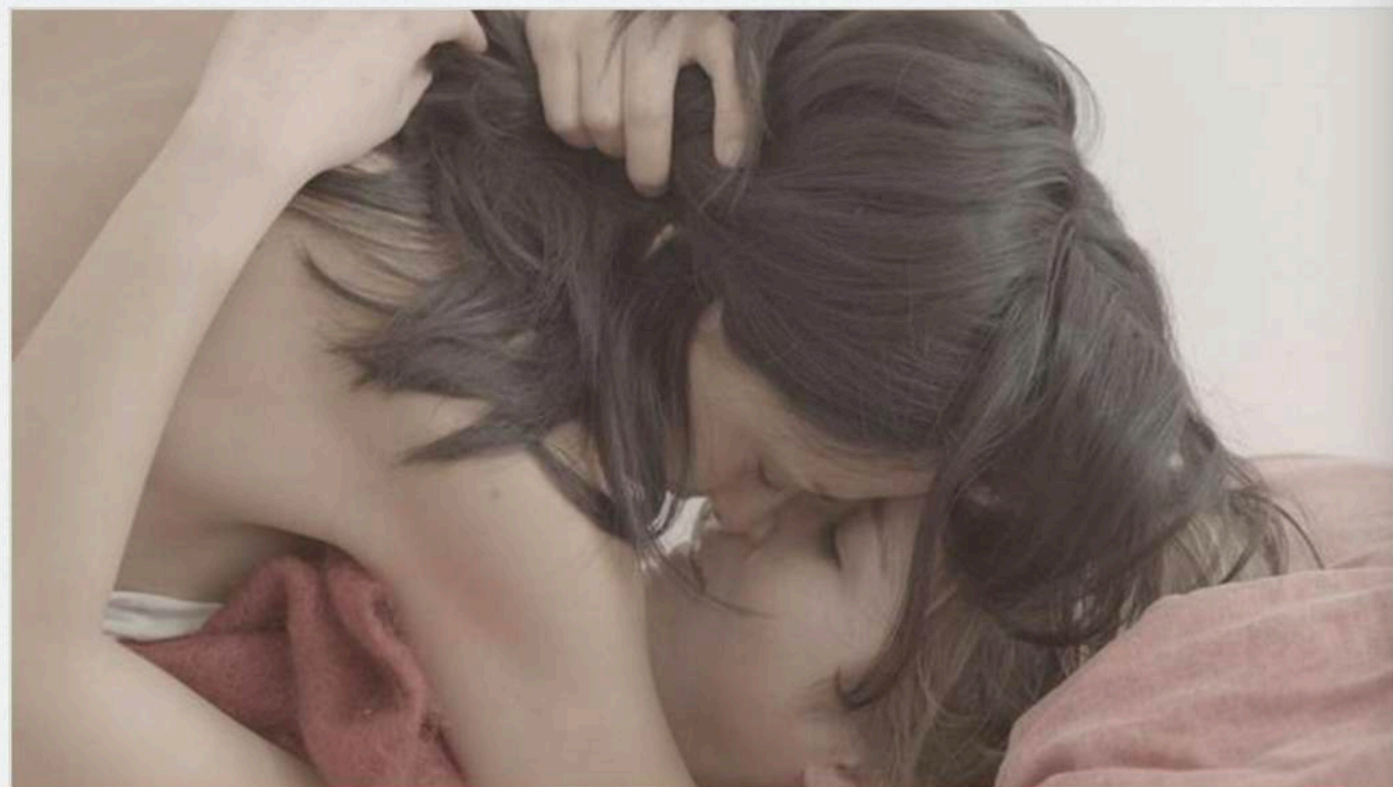
An intimate scene from Starting From...Now!

Starting from...Now! hones in on the lives of four gay women in inner-city Sydney. Debuting in 2014, the series began as a cutesy, no-frills, conversational offering, but gained a widespread following thanks to its bold exploration of unvoiced issues in the lesbian community. As its popularity grew over the second and third seasons, so too did its confidence, and thus its overall quality and effectiveness.